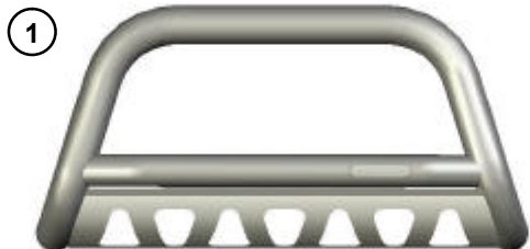
Bull Bar / Dakar Sport