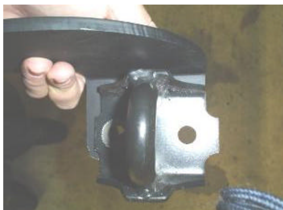
Bracket and tow hook. Passenger side.