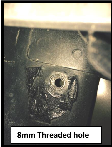
8mm Threaded hole

Step 2: Depending on your cab model, you will have to identify which hardware you will have to use for the upper (3) mounts on the underside of the body. There will either be existing 8mm threaded holes for the M8 x 20mm hex head bolts or open slots for the 3/8" speed clips and 3/8"x 1 1/4" Hex bolts.