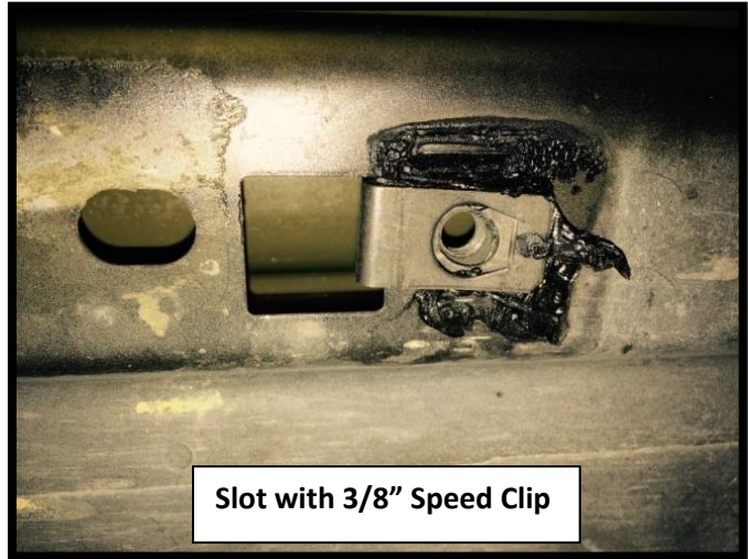
Slot with 3/8" Speed Clip

Step 3 Carefully raise step rail up to the pinch weld of the body and align brackets up with the factory mounting locations.