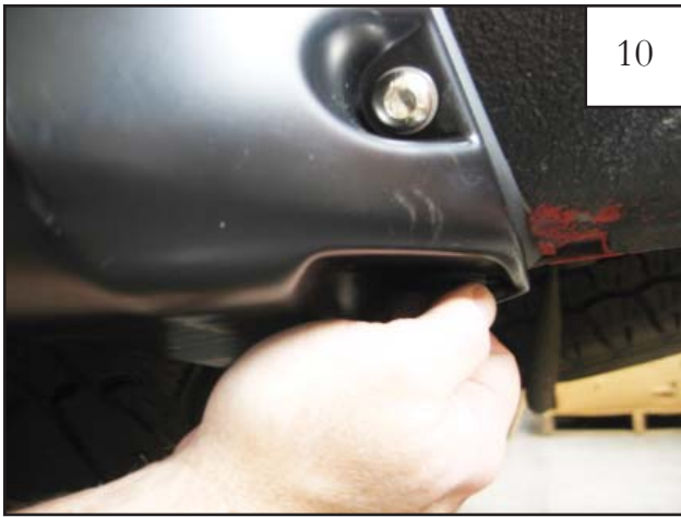
Start Fender Brace Nut removed in Step 4 on fender brace bolt.