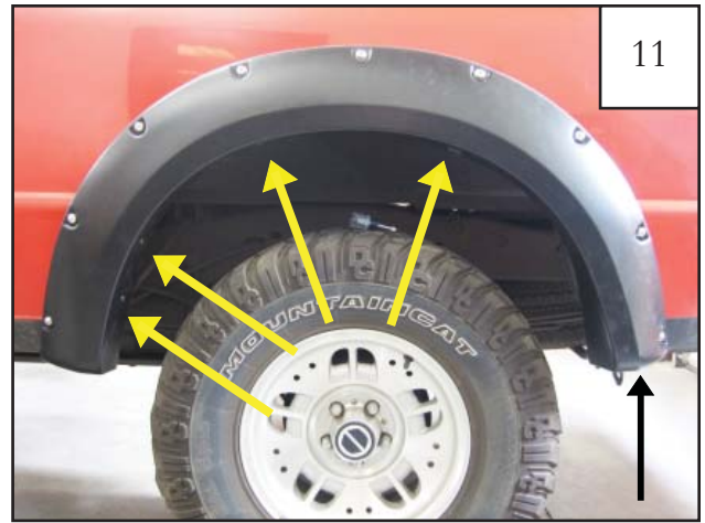
Ensure proper placement of flare and tighten all screws and the brace nut.