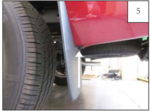
Remove one hex bolt from underside of mud flap using a 10mm socket. Discard mud flap.