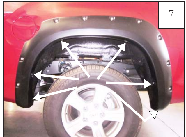
Hold flare firmly on the fender. Start a supplied Screw (SW1-0036) through each hole in flare and into hole in fender. (6 locations)