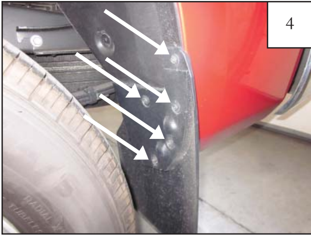
Remove five hex bolts from factory mud flap using a 10mm socket.