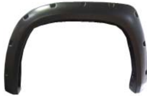
Passenger Side x1