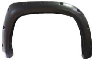
Driver Side x1