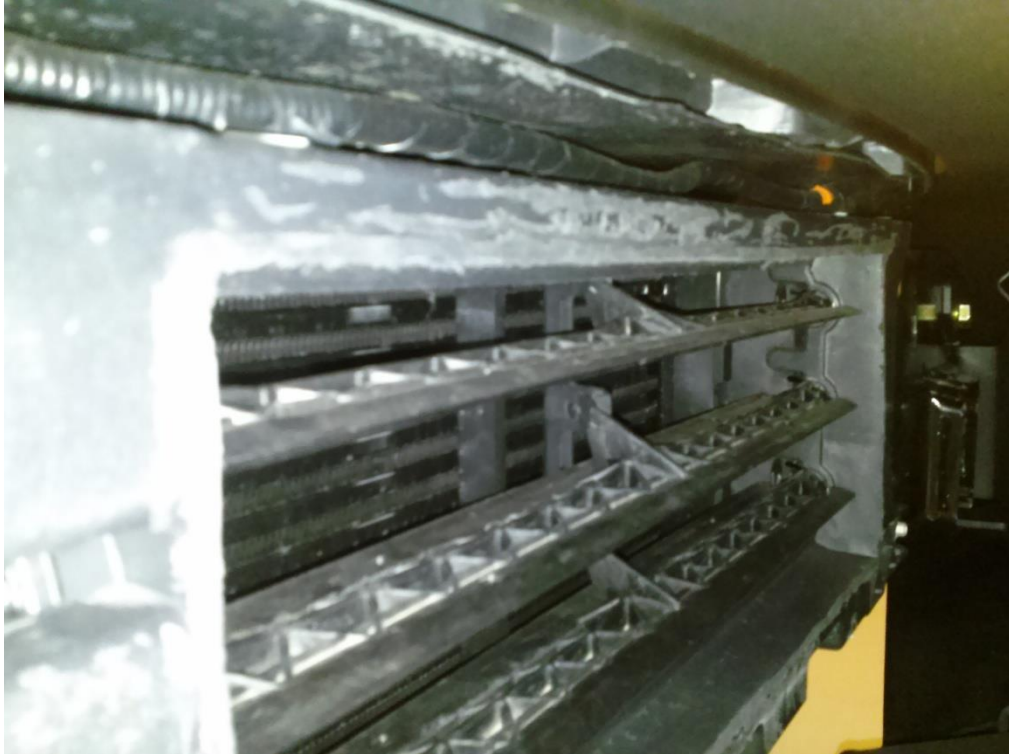
Figure 4 (Louver w/ shroud cut away at base)

be taken not to damage louvers when cutting around the base of the rectangular shroud, a cut off wheel is recommended.