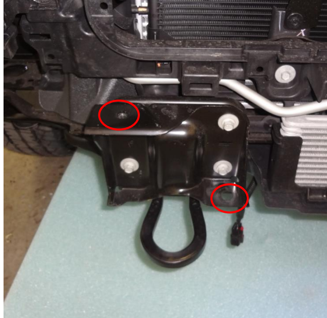
Figure 3a (TOW HOOK & OEM MOUNTING BRACKET)