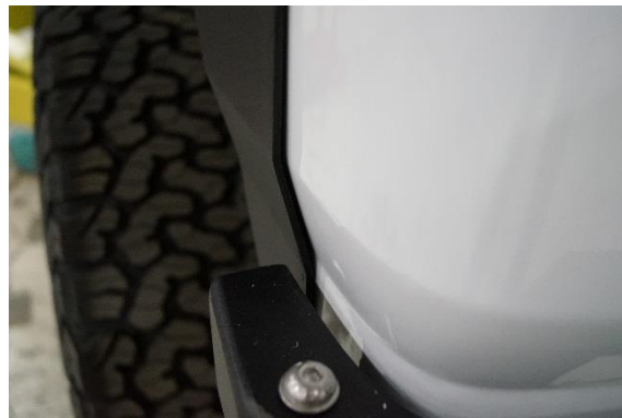
Figure 6a. Initial placement of fender for marking mounting points correctly.