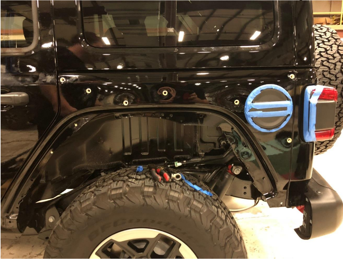
Figure 8. All rivet nuts installed and holes drilled. Red arrows indicate holes to drill out to 17/32"; yellow arrows indicate holes to drill out to 3/8".

6. Once all rivet nuts are installed you can install the fender base. Start by re-installing the middle bolt and the lower, forward bolt. This will hold the fender on vehicle while you install the rest of the hardware.